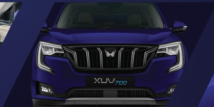
STRIKING CLEAR-VIEW LED HEADLAMPS WITH DRL