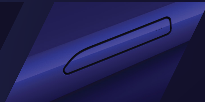
SMART DOOR HANDLES