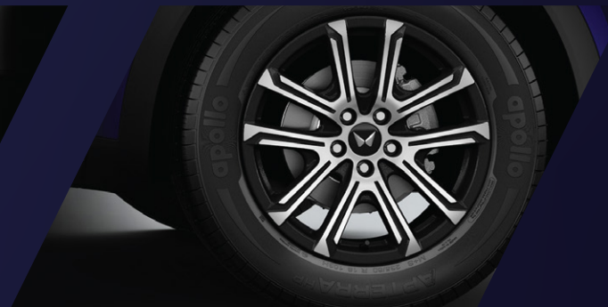
R18 DIAMOND-CUT ALLOY WHEELS