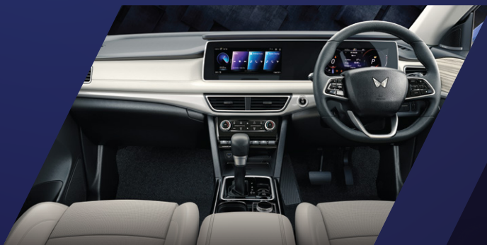
LUXURIOUS AND SOPHISTICATED INTERIORS

The new XUV700 is effortlessly impressive with its bold stance and style lines. Add the Skyroof™ and distinct LED lights, and you've got an SUV that can't be ignored.