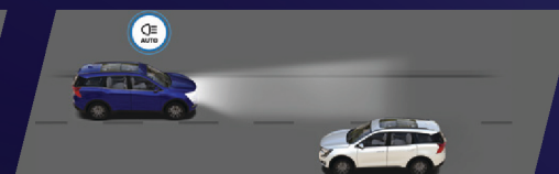
HIGH BEAM ASSIST