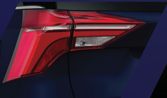
CAPTIVATING ARROW-HEAD LED TAILLAMPS