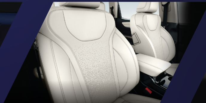
PLUSH LEATHERETTE SEATS