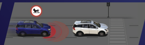
AUTOMATIC EMERGENCY BRAKING