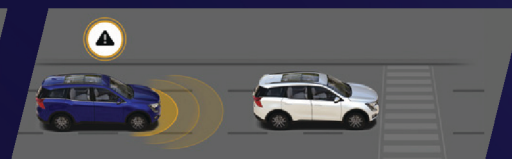
FORWARD COLLISION WARNING