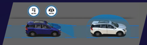
SMART PILOT ASSIST