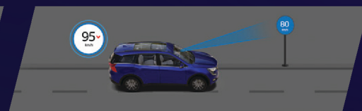
TRAFFIC SIGN RECOGNITION