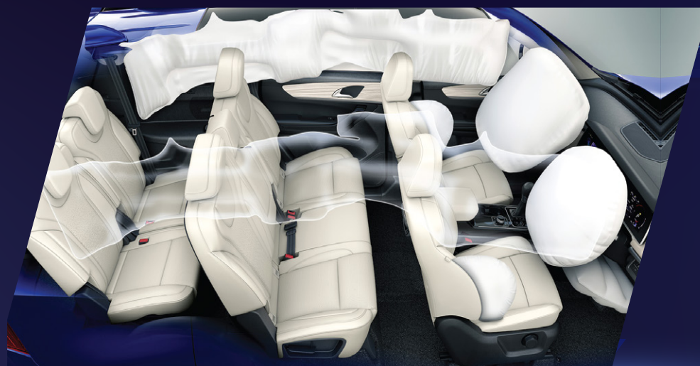
BEST-IN-CLASS 7 AIRBAG SAFETY